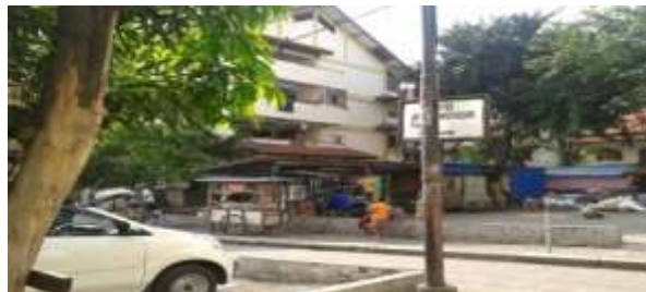
The shared space in flats environment