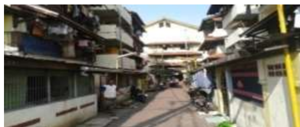
The shared space in flats Environment