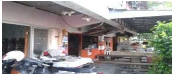
The shared space in flats environment